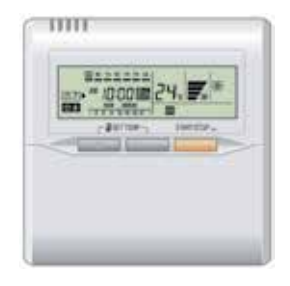
Wired Remote Controller*