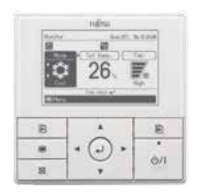
Backlit Wired Remote Controller*